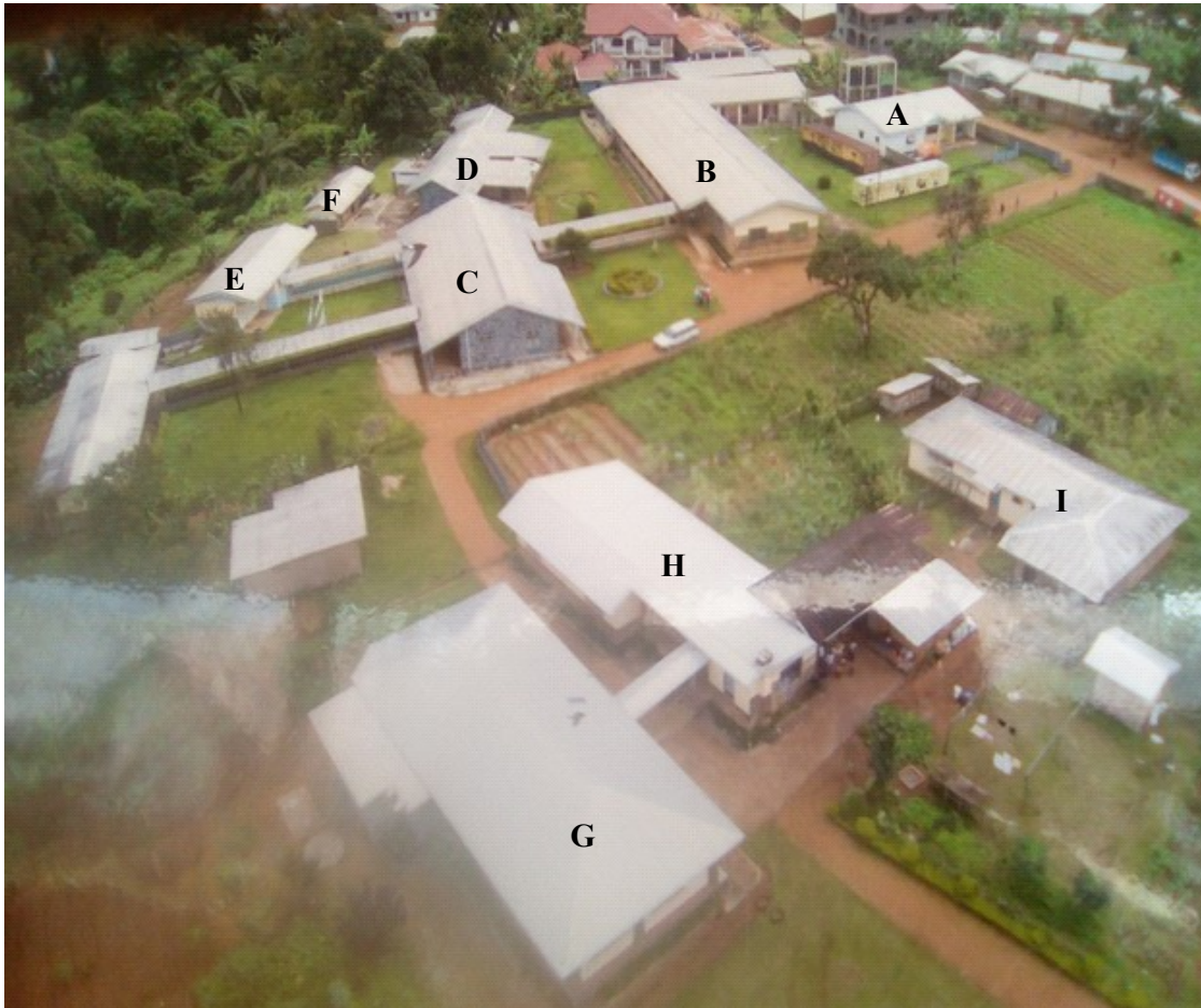
Fig7: Saint Elizabeth's Catholic health Centre

Fig 7: shows Saint Elizabeth's Catholic health centre Bali-Nyonga taken from the sky using a drone. Building A is the doctors' house. The doctor is resident in the centre for emergency. Building B harbors the children, women, men and private wards. Here there is a small conference hall, nurse's station, consultation, laboratory and the matron's office. Building C contains a labor, delivery room and maternity. In building D, we have a canteen and an ultrasound and echography unit. Building E kitchen and F an external toilet. Buildings G, H and I is the residence of the health centre's matron and some sisters. From the photo, the Saint Elizabeth's Catholic health center Bali-Nyonga has an organized structure.