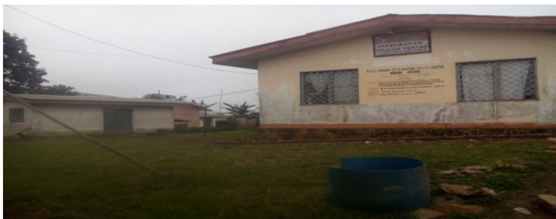
Fig 8: Bali Integrated Health Centre

Table 4 shows the various facilities available at theBali Integrated health Centre