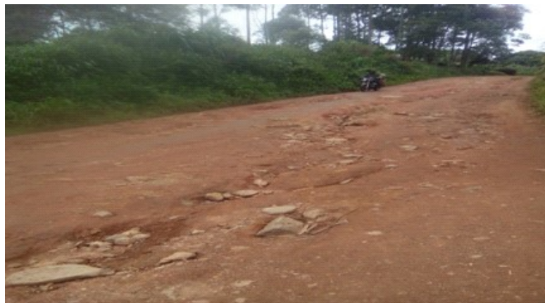
Fig 9: Photo of a degraded portion of a road in Bali-Nyonga

Main tarred road in Bali-Nyonga is the Bamenda Enugu highway that passes through, covering