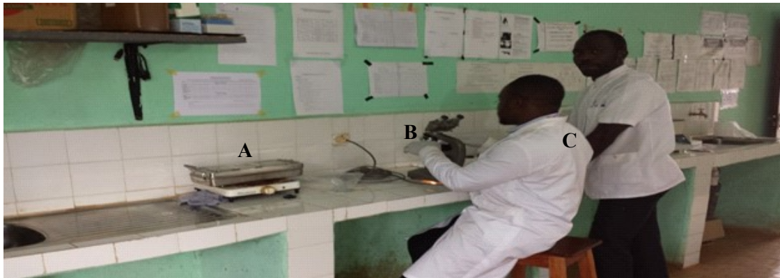
Fig .4: Bali district hospital laboratory

Figure 4 shows a photo of Bali district hospital laboratory. Three elements labled A,B and C can be identify. The first element A is an electric heater with a drum sterilizer on it. They are used to heat and disinfect or sterilize slides and other instruments used in the laboratory to collect spa cements. The second element B is a microscope used in examining spa cements. Then C are some laboratory technicians examine a spa cement with the microscope.