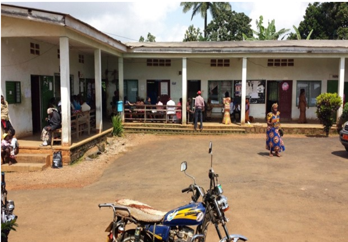
Fig 5: Bali district hospital administrative block

Figure 4 shows a photo of Bali district hospital laboratory. Three elements labled A,B and C can be identify. The first element A is an electric heater with a drum sterilizer on it. They are used to heat and disinfect or sterilize slides and other instruments used in the laboratory to collect spa cements. The second element B is a microscope used in examining spa cements. Then C are some laboratory technicians examine a spa cement with the microscope.