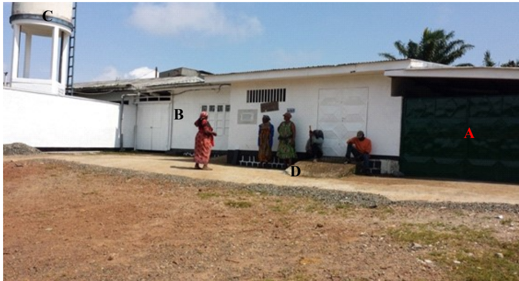
Fig -6: Bali district hospital mortuary