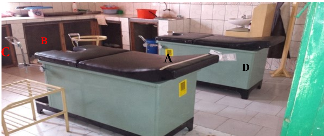
Fig3: Bali district hospital delivery room