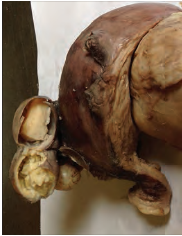
Figure 1: Photograph of uterus with cervix and dilated right fallopian tube containing yellow material

of Aspergillus species [Figure 2]. There was follicular cyst in the ovary.