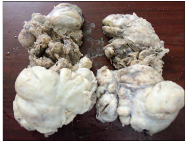
Figure 1: Gross photograph showing multinodular tan colored tumor mass with many nodules in the periphery and dilated blood vessels

In the reviewed literature, most common presenting symptoms were abnormal bleeding and pelvic mass. The tumor can vary from 10 to 25 cm. Microscopically, the tumor shows fascicles of uniform smooth muscle cells with no atypia, mitotic activity, or necrosis. The nodules of smooth muscle fascicles are separated by marked hydropic change and highly vascular stroma. It is believed that the poor mechanical support in the exophytic part of the tumor may lead to breakdown of hydropic stroma, exposing the neoplastic smooth muscle nodules to produce exophytic nodules. These nodules along with the stromal blood vessels give the characteristic red-brown color to the tumor. [7]