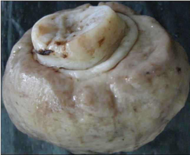
Figure 1: Gross specimen showing polypoid, pedunculated, glistening, grayish-white tumor mass