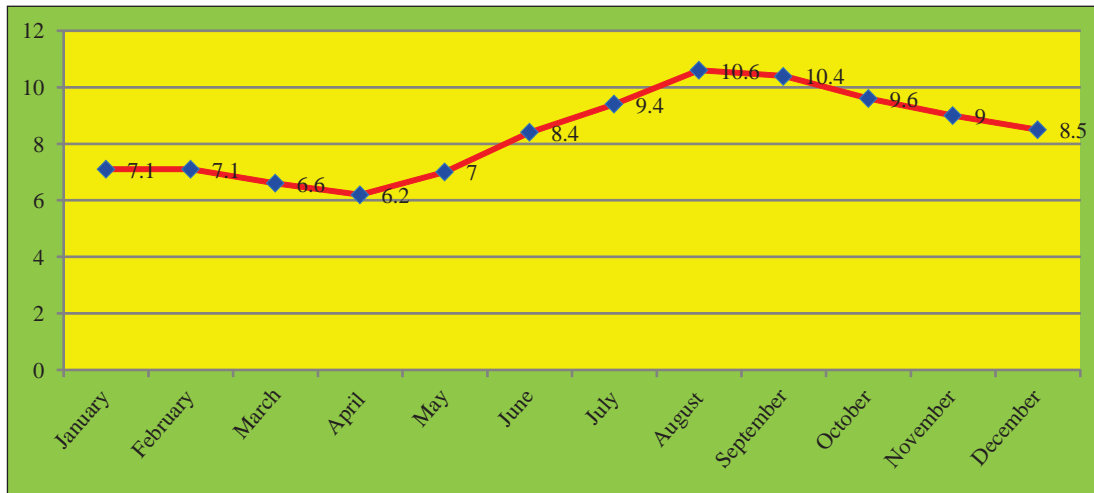
Figure 1: Percentage of birth in a teaching institute according to calendar months, 2002-09