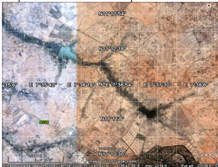
Plate 1: Satellite image of the study area: University Farm Lake and Bomo Lake

The surface streams, which are the major sources of recharge to the dam, are seasonal. The Bomo dam (Figure 1) which is situated upstream of the dam, still within the drainage basin of the ABU Farm Lake, is also seasonal, drying off completely towards the end of the climatic dry season. The impounding reservoir is effluent, recharged also by groundwater. This groundwater recharge causes that the spillway is flowing until 5 th of November, about one month after cessation of rains. Although the dam is grossly underutilized - only few portable diesel pumps are watering irrigated plots located close to the edge of the water - yet the level of water is well below the spillway for a greater part of the year due to the seepage under and through the embankment, and to evaporation.