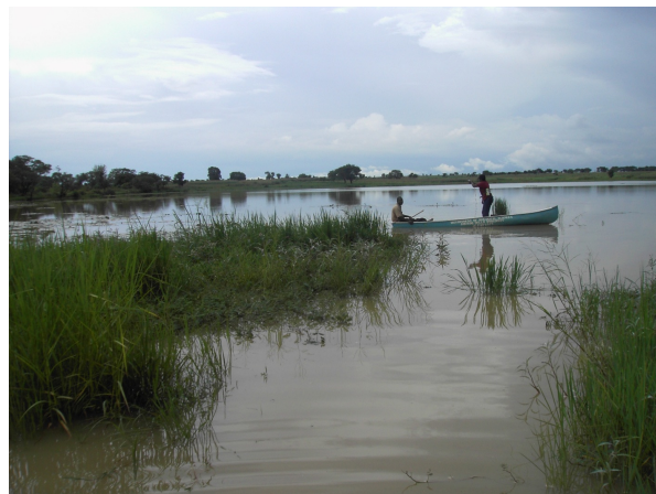
Plate 3: After forty three years of existence the original storage has been reduced by siltation.

Rate of siltation can be converted into the average rate of erosion in the University Farm Lake drainage sub-basin. The total drainage basin, with Bomo Lake in its headwaters, is 18,082,500 m 2 , but since Bomo Lake acts as a sediment trap, the University Farm Lake has as deposit only material eroded in the University Farm Lake sub-basin (Fig. 1). Area of this sub-basin, measured in Fig. 1, is 11,931,875 m 2 . Then, rate of erosion in the University Farm Lake sub-basin between 1966 and 2009 was 6,600 m 3 /y : 11,931,875 m 2 = 0.000553 mm.m/y = 0.553 m 2 /y.