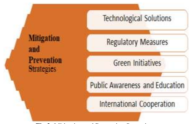
Fig 2: Mitigation and Prevention Strategies

ecosystems, and promoting a sustainable future (Epelle et al. , 2023)