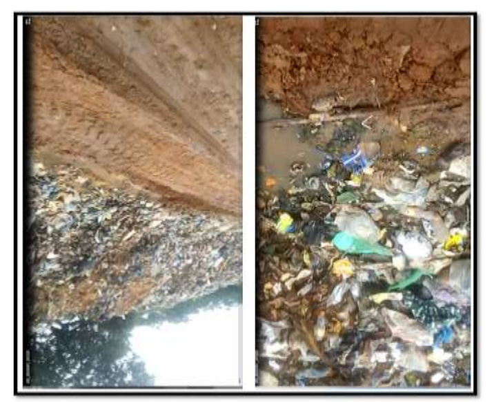
Fig 2: Some sections of the Ikhueniro dumpsite EGBON, I. I; OKORIE, T. G; IMADE, O. S.