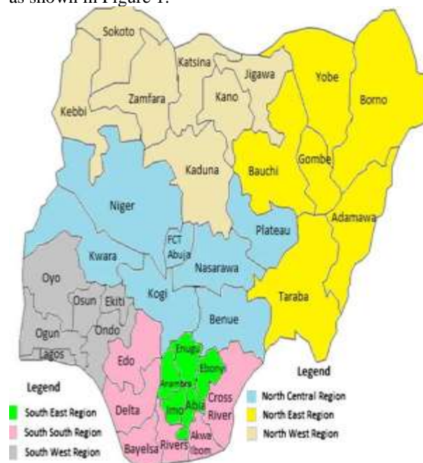
Fig 1: Map of Nigeria Showing Six Geopolitical Zones Abbreviation: FCT; Federal Capital Territory

Studies conducted on the use of potassium bromate in bread products in Nigeria despite its ban: Nigeria is the most populous country in Africa and 6 th in the world with an estimated population of 210,431,790 (Statista, 2022b). The country is divided into six (6) geopolitical zones with an estimated 400 ethnic groups and 450 languages (Okorie et al. , 2013). The 6 geopolitical zones are North Central, North East, North West, South East, South-South and South West as shown in Figure 1.