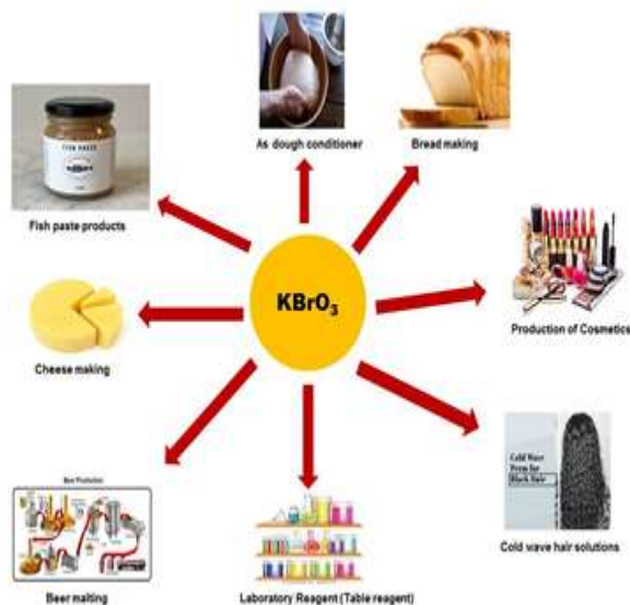
Fig 2: Different Uses of Potassium Bromate ( \text{KBrO}_3 )

Likewise, \text{KBrO}_3 is a byproduct of water disinfection produced when waters containing bromide are ozonized (treated with ozone), thus frequently detected in tap and bottled water (Dongmei et al. , 2015; Altoom et al. , 2018). Liu and Mou (2004) stated that “bromate is one of the most prevalent disinfection by-products of surface water”. Ozonation is an effective and efficient means of disinfection due to its ability to clear microbes leading to significant decrease in the level of carcinogenic trihalomethanes (THMs). The Ozonation process introduces ozone in the water which can lead to hydrobromic acid formation with increased content of bromide which subsequently forms brominated organic by-products and bromate (Fiessinger et al. , 1985).