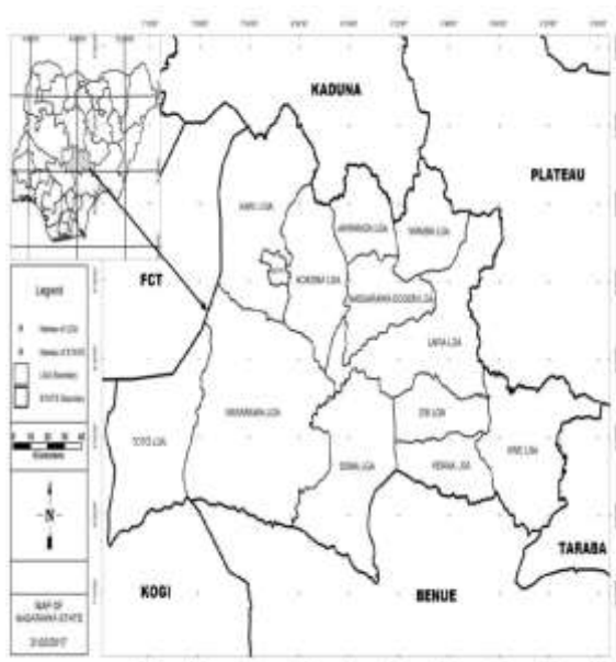
Fig 1: Map of Nasarawa State showing Nasarawa Local Government Area

continued until the digest appeared light-coloured and clear. It was then brought down and allowed to cool, the sample was then filtered through Whatman No. 1.0 filter paper and the filtrate was made up to mark in 50.00cm 3 volumetric flask using deionized water and kept awaiting metal analysis (Aloke et al. , 2019, Singh et al. , 2012).