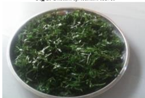
Fig 2: Sliced Gnetum africanum leaves