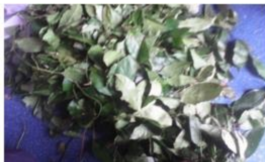
Fig 1: Gnetum africanum leaves

Proximate and \beta -carotene contents of the dried samples were determined using standard laboratory procedures as described by the Association of Official Analytical Chemists (AOAC, 2005). Sensory evaluation was carried out based on 9-hedonic scale with 9 being like extremely and 1 is dislike extremely. This was carried out using the basic setup of 20 people minimum for hedonic test described by Singh-Ackbarali and Maharaj (2014) and these comprised mainly of undergraduate students. Data collected were analyzed statistically to determine the effect of drying methods on the nutritional and sensory properties of Gnetum africanum leaves.