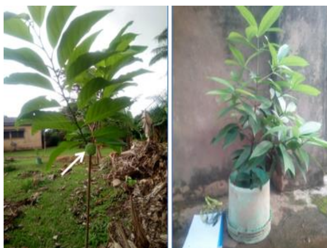
Plate 4: (a) Sugar apple and (b) Bell apple plants at age 350 days after planting in garden soil, showing a newly developed fruit (white arrow).

The control seeds did not germinate within 42 days after germination (Table 2, Plate 1). Similarly, those