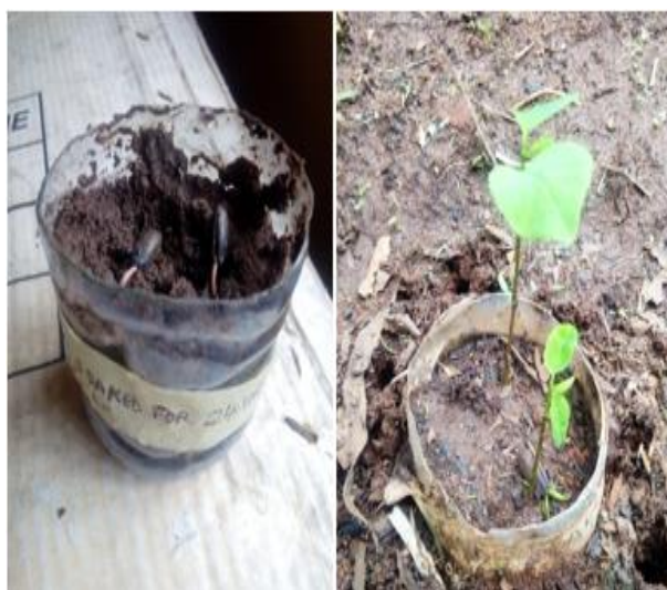
Plate 2: Seedling grown from seeds soaked in tap water for 24 hours.