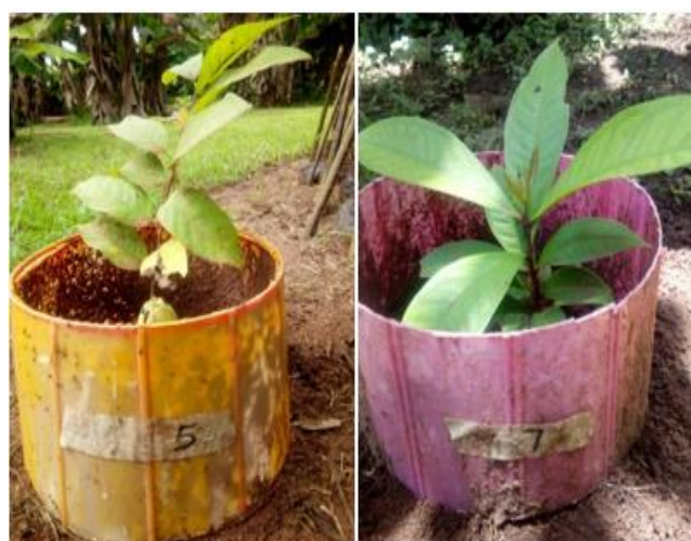
Plate 3. (a) Annona squamosa and (b) Passiforia burifolia seedling obtained as seedling at 35 days after planting.