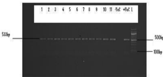
Fig 2: Agarose gel electrophoretogram of mecA Methicillin-resistant S. aureus after PCR analysis which bands at 500 bp Key: L -100 bp ladder (DNA marker fragments); Pos – The MRSA positive control; Neg–Negative; Lanes 1 -11 are the mecA positive samples

Hospital is a major reservoir of variety of pathogens. These pathogens are usually normal flora of the human body especially S. aureus , which is known to cause nosocomial infection. MRSA strains are often resistant to a wide range of antimicrobials, thereby posing a great danger to those are infected. Especially, those of