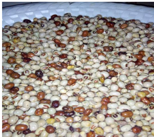
Fig 1. African yam bean seeds