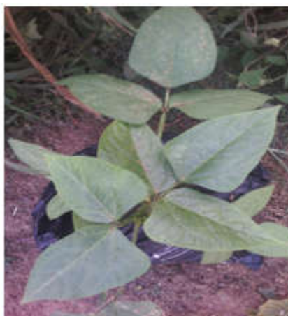
Plate 2b: Showing treated cowpea plant