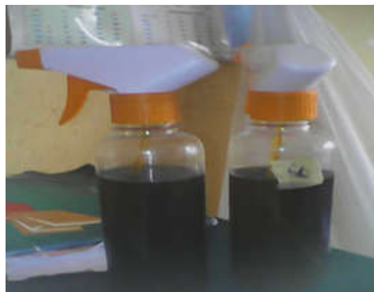
Plate 1: Showing Formulated Biopesticide in Spray Bottle

This means Piper nigrum powder can as well be used for cowpea grain storage (Shazia et al. , 2006). This corresponds with the work of Simon, (2012) that Azadirachta indica , Xylopi aethiopia , Zingiber officinal and Ocimum gratissimum are effective in the control of pests. This could be as a result of the alkaloid and terpenoid present in the extracts.