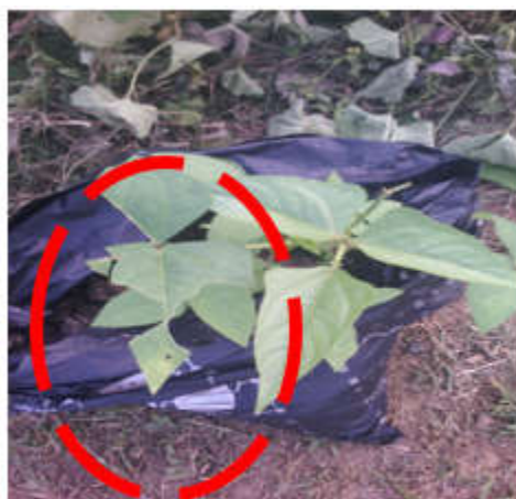
Plate 2a: Showing untreated Cowpea Plant

effective pest control, leading to significant decline in the population of the test pests as compared with untreated controls (Oparaeke et al. , 2007). Addo, (2017), furthermore confirmed the effect of aqueous ginger ( Zingiber officinale ) extracts on the management of major pests of cabbage ( Brassicae oleracea var.capitata). similarly, Ukoroije et al. (2019), studied the efficacy of Ocimum gratissimum leaf powder and ethanol extract on adult Periplanata americana and detected that there was significant difference in mortality in both increase in concentration levels and exposure time at 5% level of significance in both leaf powder and ethanol extract.