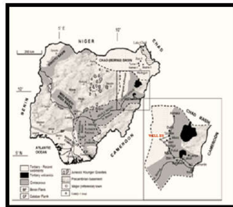
Fig 1: Map of Nigeria showing Area and Locations of Study. (Modified from Obaje et al. , 2005)

basin fill in well DX, define candidate chronostratigraphic surfaces and classify the strata.