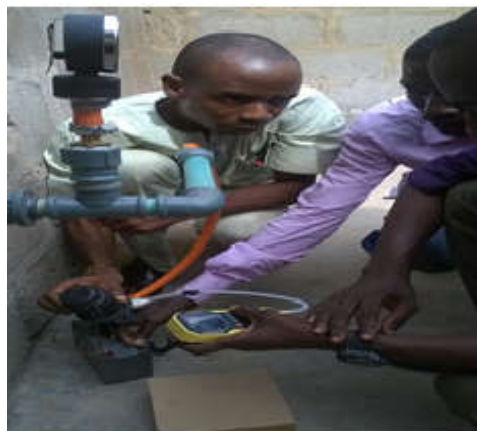
Plate 2: Digital gas detector being used for biogas analysis

Procedures for Chemical and Microbial Analysis of Slurry Samples: The following chemical parameters were determined in the laboratory from the samples of digester and effluent slurries: nitrogen, phosphorus, potassium, calcium, C: N ratio, organic matter, sodium, magnesium, iron, lead, copper, zinc and cadmium according to Anon, 1992; APHA, 1998; AOAC, 2002; APHA, 2005. The microbial analysis of influent and effluent samples were carried out using multiple fermentation method to estimate the most probable number (MPN) of coliform organism in 100 ml of sample for diagnosis of bacteriological contamination according to Tillet et al. , 1987 and Senior, 1996.