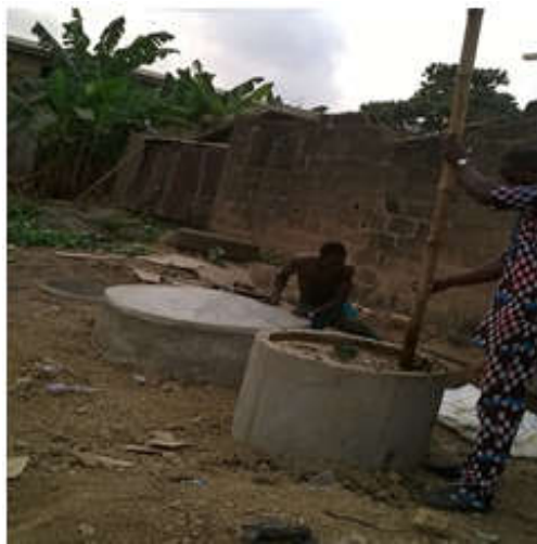
Plate 1: Feed Stock Materials Mixing in the Inlet Tank

Each feedstock was fed into the digester and the readings taken accordingly until the retention time is reached before the next feedstock was loaded. Analysis of the effluent (slurry) was carried out with the intention to determine its suitability for farm application as organic fertilizer. Samples of the effluent slurry were taken after one month of retention in the digester. Proper stirring of the content inside the digester was carried out to ensure uniform decomposition, using a specially fabricated stirrer improvised with the digester.