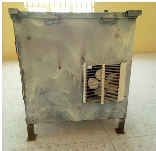
Fig 2: Back view of enclosure

The inside of the enclosure was lined with a 15 mm thick mineral wool (sound absorber) and padded with 5 mm thick plywood. A flexible pipe is connected to the generator exhaust pipe to dissipate the exhaust gas into the atmosphere. An induction fan was installed to