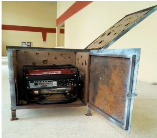
Fig 1: Front view of enclosure

Department of the Niger Delta University Bayelsa State.