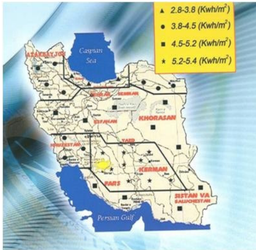
Fig. 2: Average annual solar radiation in Iran, (Source: Iran's Academy of Solar Industries)