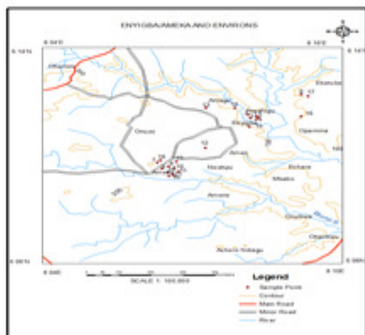
Fig.1. Location Map of Enyigba, Ameri and Ameka at Abakaliki, Ebonyi State