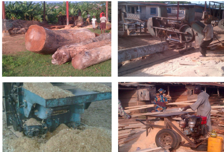
Fig 1: Activities that generate wood waste in a typical Nigerian sawmill (Babayemi et al., 2010)

of waste produced and the management of waste generated in such a way that the economic, social and environmental goals of sustainable development are largely achieved (Pianosi, 2012). According to (IISD, 2016), sustainable development is a development that satisfies the needs of the present generation without jeopardizing the ability of future generations to meet their own needs. Most countries are enacting policies that encourage waste reduction and promote effective waste utilization. The ability of any country to adapt, become more eco-friendly and resource efficient while still competitive depends on its level of eco-innovation (European Commission, 2014). Globally, it is becoming more and more imperative to reduce resource utilization and its environmental impacts while maintaining a steady rise of competitiveness. Using recycled resources in production processes instead of new materials usually result in less consumption of energy and original materials, less waste landfilled, and less Green House Gas (GHG) emissions over a product's life cycle. Figure 1 shows various wood processing activities including debarking, trimming and planing in a typical Nigerian sawmill.