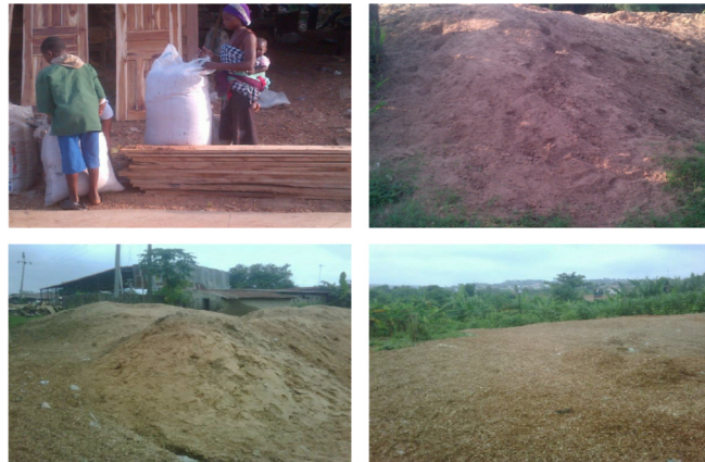
Fig 2: Local collection and dumping of wood waste in and around a Nigerian sawmill (Babayemi et al., 2010)

Fig 2 shows collection and dumping of wood waste in and around a typical Nigerian sawmill.