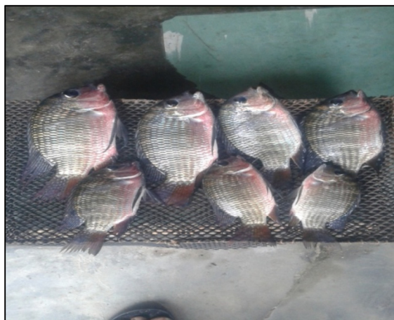
Fig 2: Tilapia guineensis

Oceanography and Marine Research fish farm, Buguma. Some table size of each fish species were collected, cleaned, wrapped in aluminum foil and put into ice. The entire content was put in a black polyethylene bag and carried in a cooler for analyses.