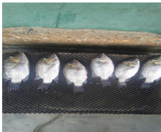
Fig 3: Sarotherdonmelanotheron

Sample Analysis and Quality Control: The sample analysis with X-ray fluorescence was carried out at Fugro Nigeria Limited, Port Harcourt. The amount of chromium, cobalt, nickel, cobalt and zinc were determined using X-ray fluorescence spectrometer in accordance with USEPA 6200. Fish samples were oven dried at 110°C for twenty hours. With the