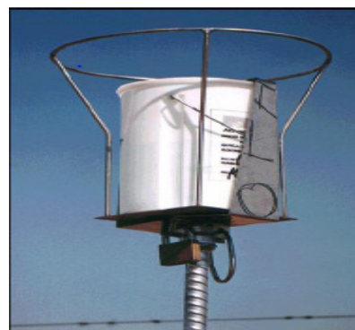
Fig. 3: Single open bucket sampler (ASTM D1739, 2010)

The method did not have a wind shield around the bucket so that both coarse and fine precipitating dust samples could be collected irrespective of the wind situation. Settling dust material was collected in 20 L cylindrical plastic buckets half filled with distilled water (10 L). The height (h), radius (r) and the area (A) of the bucket (bottom) are 0.342 m, 0.138 m and 0.060 \text{m}^2 respectively (Figure 3). Exposed buckets were replaced after 30 days of sampling period and transported to the laboratory for further treatment and analysis. Water – dust sample mixtures were separately filtered through pre-weighed 0.47 mm Whatman filter papers under low pressure. The samples were air dried in partially open petri dishes in a “dust free laboratory”. After drying, gravimetric analysis was conducted to determine the insoluble fraction which is based on dust deposition rate equation: