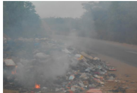
Fig. 5: Dumpsite at Amawbia