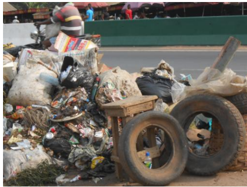
Fig. 3: Dumpsite at Eke Awka