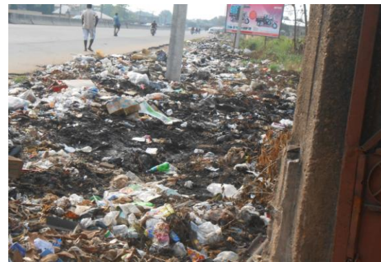
Fig. 4: Dumpsite at Emma Nnaemeka street Awka