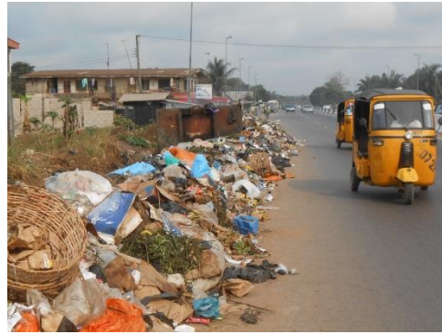
Fig. 2: Dumpsite at Umueze behind community primary school

Pictures of the aforementioned dumpsites are listed below: