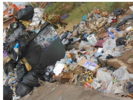
Fig. 6: Dumpsite at Umubelu Awka