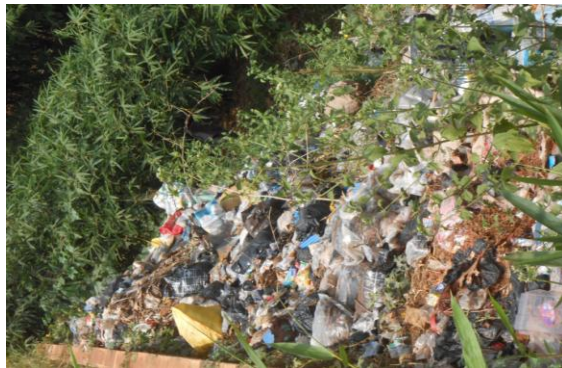
Fig. 1: Dumpsite at Agu Awka