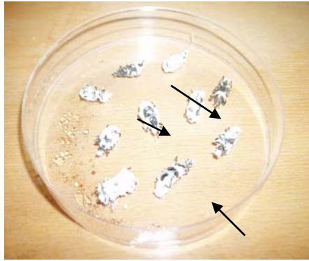
Plate 1: Adult C.sordidus infected with B.bassiana . Notice white fungal growth at intersegmental junctions (arrows)