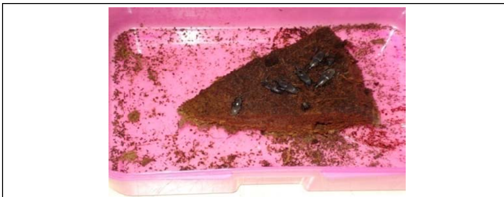
Figure 1: Banana weevils infected with Beauveria bassiana and introduced into plastic containers with banana corm.

Weevils were inoculated by dipping them into 20 ml fungal suspension with a conidia concentration of 10^8 conidia \text{ml}^{-1} for 11 seconds. The suspension was then drained off and weevils were transferred to plastic containers. Banana corms were then placed in the plastic containers as food for the weevils and placed in the laboratory in a dark room. Control weevils used as a check were dipped in sterile distilled water containing 0.01% Tween 20. Mortality of the weevils was recorded every 3 days for 40 days. The experiment consisted of five replicates for ICIPE 279, M573, ICIPE 273 and KE300, and four replicates for ICIPE 50, M470, M207, M618, M221 and M313.