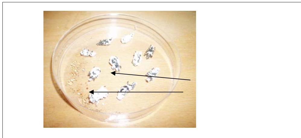
Plate 1: Adult C. sordidus infected with B. bassiana . Notice fungal growth at intersegmental junctions (arrows)

Incubation of the dead weevils in humidified chambers resulted in development of mycelia on the surface of the cadaver, starting from the intersegmental junctions of the body and legs (Figure 2). No fungi grew on dead weevils in the controls since they died due to other causes apart from the fungus.