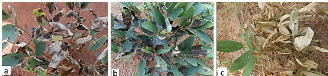
Fig 2. Some symptoms of Bambara groundnut leaf diseases observed in the field

Alternaria sp and Curvularia sp had their prevalence higher than 25% in each climatic zone. While Cladosporium sphaerospermum and Cercospora sp were the most prevalent (83.33%) in Sudan zone, Curvularia sp was the most prevalent (69.77 %) in Sudan-Sahel zone. In Sahel zone, Fusarium equiseti and Exserohilum rostratum were the most prevalent (68.42%). Nineteen isolates constituted with the most prevalent species were identified using molecular identification approach (Table 2). BlastN comparisons between the 19 isolates contigs of the 16 major fungi that were produced by their DNA sequences assembly and GenBank sequences yielded identity scores of 99 to 100 % with all of them (Table 2). The degrees of similarity between these contigs and the loci sequences of classified fungi in GenBank indicate that our fungal isolates are the same species with those in Genbank, particularly the first of the list show after the blastN. Of the nineteen (19) fungi isolates subjected to molecular analysis, fifteen (15) species were identified (Table 2).