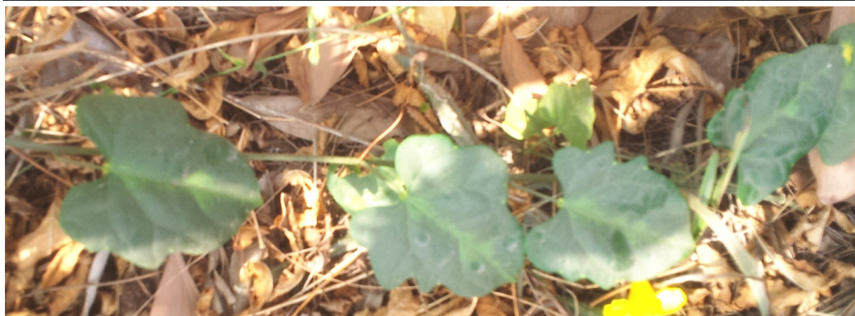
Photo 2: Snake climber liana, Adenia cissampeloides (Planch. Ex Hook.) Harms (Passifloraceae)