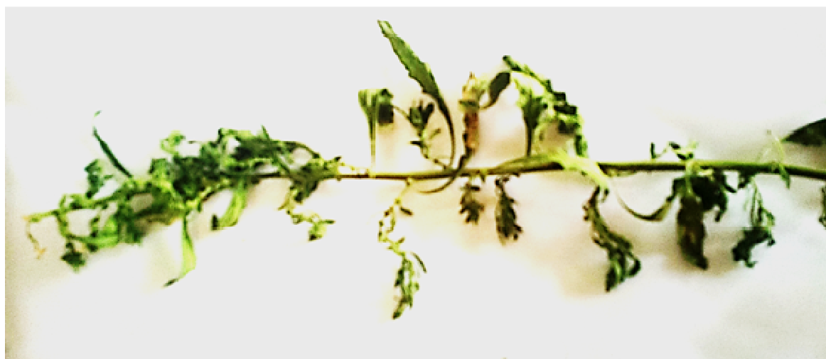
Photo 1: Wormseed trunk, Chenopodium ambrosioides L. (Chenopodiaceae)

depend partly on the type and efficacy of suitable flora available in different locations. However, the number of plants that are known to possess insecticidal activity against storage insect pests is rather small. It appears necessary to develop alternative techniques to protect stored foodstuffs. Thus, this study aimed to evaluate effects of two ground leaf powder on population and damage of C. maculatus on stored pulse grains. C. ambrosioides (Chenopodiaceae) is a strongly aromatic, hairy, annual or perennial herb. It is abundant in the tropics and subtropics, especially in America and Africa (Rendle, 1983), and has been reported to have a wide variety of medicinal and insecticidal properties (Su, 1991; Quarles, 1992). A. cissampeloides (Passifloraceae) is a robust liana used in traditional medicine throughout tropical Africa. Most frequently recorded are the uses of an infusion or decoction of the root, stem or leaves for the treatment of gastrointestinal complaints, such as stomach-ache, constipation, diarrhea and dysentery (PROTA, 2010).