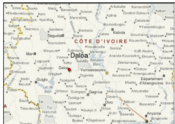
Figure 1: Localization of Daloa city in Côte d'Ivoire

Study sites and sampling methods: Daloa is a city located in western-central Côte d'Ivoire. It is about 141 km from the political capital Yamoussoukro and 383 km from Abidjan the economic capital. It had 261,789 inhabitants in 2012 with a density of 49,348 inhabitants per km 2 . It is the third biggest city in Côte d'Ivoire after Abidjan and Bouaké (Figure 1).