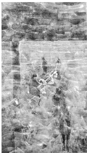
Figure 3 The Homeless , 1987 Zhu Xinghua (1935- ) Ink and colour on paper 163 cm x 95 cm Hong Kong Museum of Art

... the earthy colour makes the painting [ The Homeless ] [Figure 3] look miserable. I don't know how to describe the ways in which these colours create a miserable atmosphere. I don't know how I get this feeling.