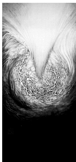
Figure 2 Break Through I Zhou Luyun (1924- ) Ink and colour on paper 135 cm x 65.5 cm Hong Kong Museum of Art

I don't know how to describe the way I feel. The sphere is composed of many layers and it makes me think of plants like onion and lettuce. Considering the title of the painting [ Break Through I ] [Figure 2], I think that it has successfully created the feeling of "breaking through".