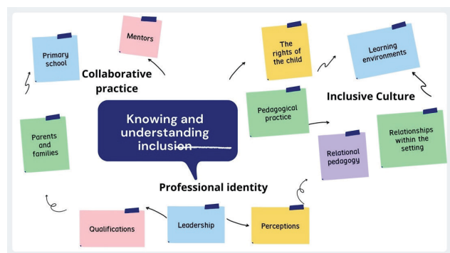
FIGURE 1. Final themes and sub-themes of the study considering the influence of the LINC programme on knowing and understanding inclusion