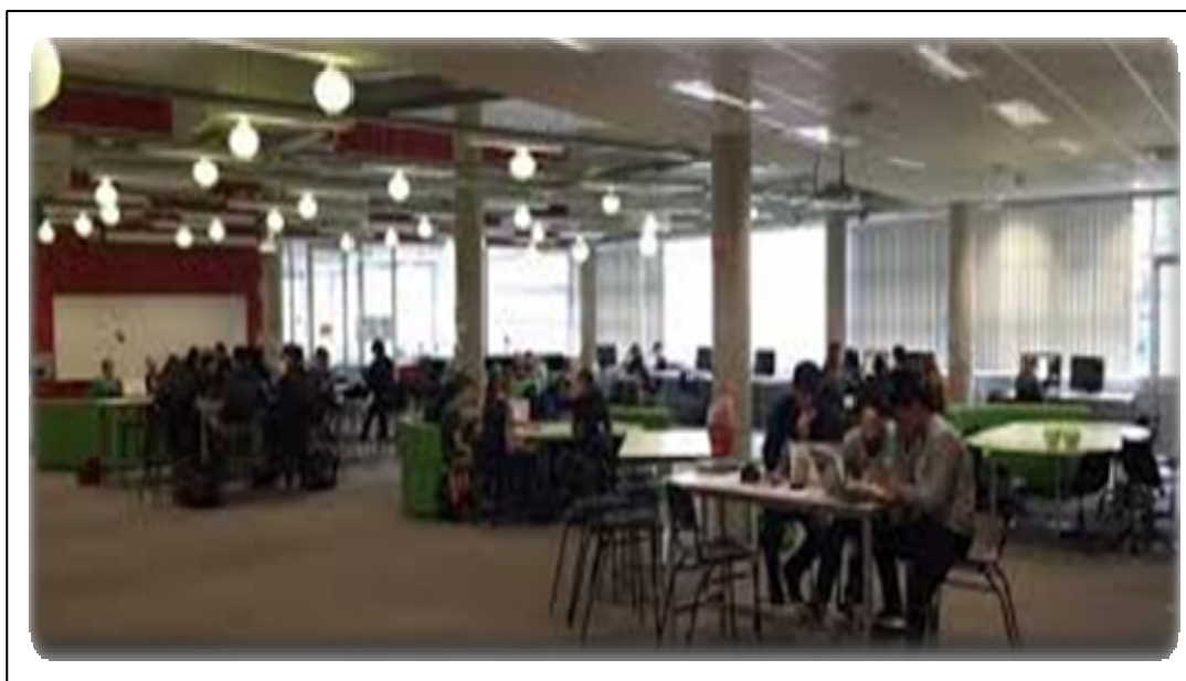
Figure 1: The Learning Commons Area of the ASMS

Wherever you are situated in the “learning commons”, whether teacher, student or support staff, you have the opportunity to “be” in learning or to be “seeing” learning in action and even “hearing” learning unfold.