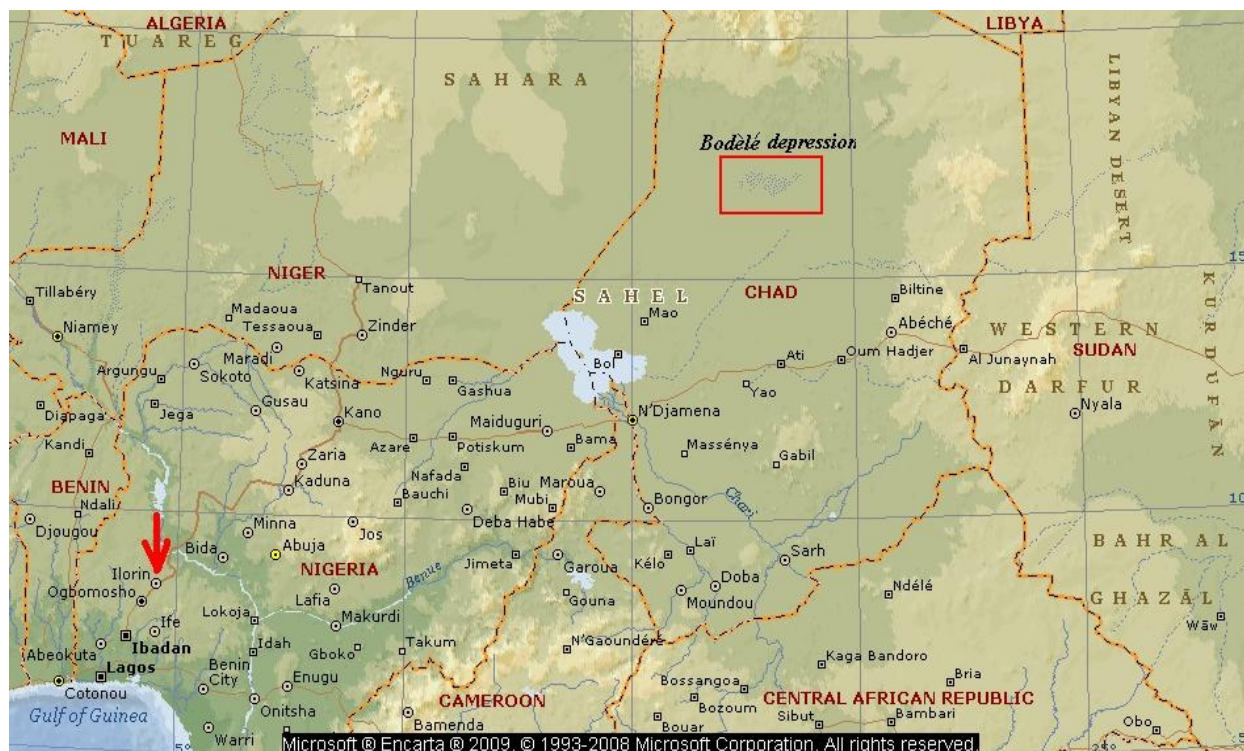
Figure 1: Experimental Location (Indicated by the Red Arrow) and the Possible Source of the Harmattan Dust (Indicated by the Red Rectangle)