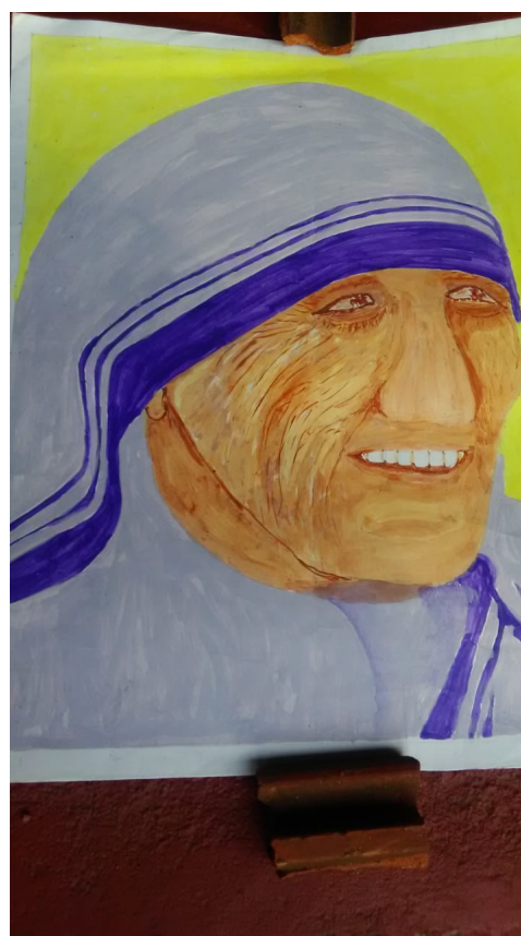
Figure 2: Painting made by Mr. R