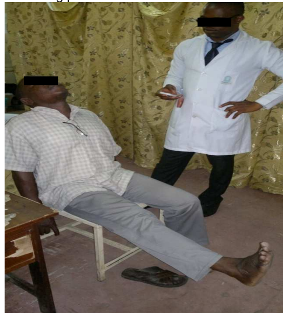
b. Ending position