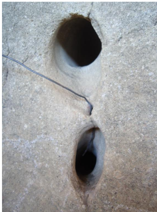
Fig 5b1. A wire demonstrating that the 2 dolmenic holes are communicated.

Fig 5a. Lower “Ear-like” hole at Alberite Dolmen (southern Spain). Fig 5b. The two “Ear-like” holes at Alberite Dolmen (southern Spain).