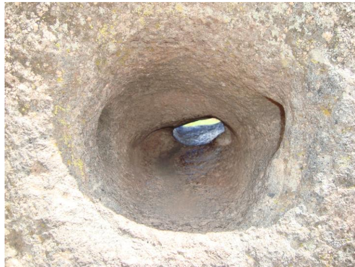
Fig 4a. Inner aspect of Tiwanaku hearing/amplifying hole.

Inner and outer photographs from the Tiwanaku hole are shown in Figs. 4a and 4b. Kalasasaya Temple ruins are shown in Fig. 4c and Sun Door placement is highlighted with a red circle; a red arrow points to the wall stone where the “ritual ear” is placed. One of the authors (AAV) is pointing out to the Tiwanaku Kalasasaya Temple hole (Fig. 4d).