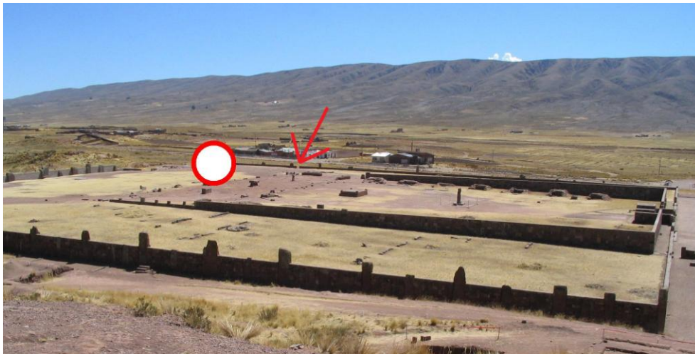
Fig 4c. Kalasasaya Temple walls. Red circle showing the Sun Door placement. The ritual “ear” is placed under the red arrow through a thick wall stone (more than 50 cm thick).