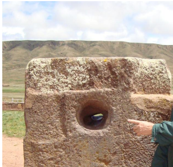
Fig 4d. One of the authors pointing out to the inner “Ritual Ear” at Tiwanaku Kalasasaya Temple.