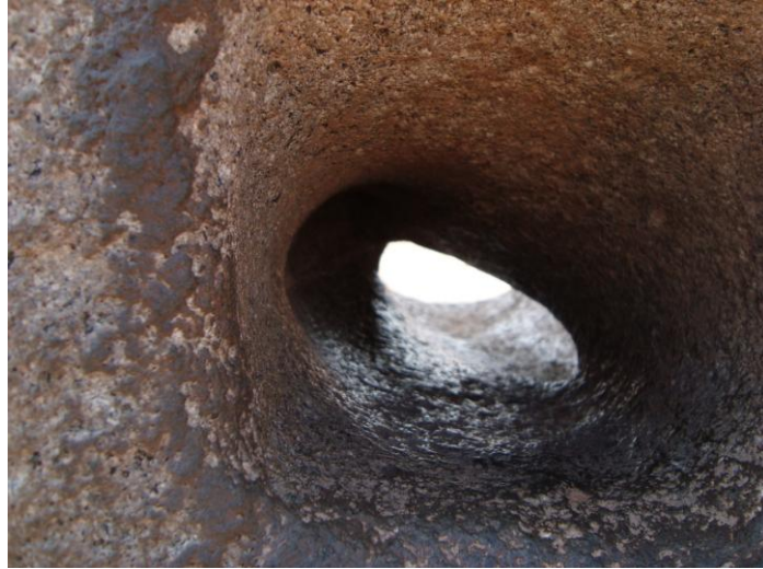
Fig 4b. Outer aspect of Tiwanaku hearing/amplifying hole.