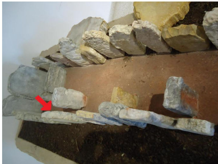
Fig 5d Arrow showing stone where ritual “Ear-like” holes are placed at Alberite Dolmen.