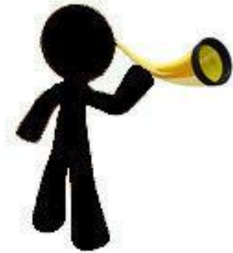
Fig 3. “Ear trumpet” for amplifying external sounds.

Inner and outer photographs from the Tiwanaku hole are shown in Figs. 4a and 4b. Kalasasaya Temple ruins are shown in Fig. 4c and Sun Door placement is highlighted with a red circle; a red arrow points to the wall stone where the “ritual ear” is placed. One of the authors (AAV) is pointing out to the Tiwanaku Kalasasaya Temple hole (Fig. 4d).