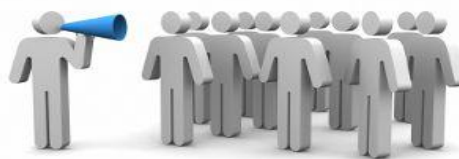
Fig 2. Megaphone for making a person voice louder to others.

The Tiwanaku hole amplifies sound, as it may be tested by any visitor to the ruins, even nowadays. Megaphone (Fig. 2) characteristics of this hole are definitively present. Theoretically, a crowd placed in the center of Kalasasaya Temple may be able to hear what hypothetical priest-shaman whispers through the hole from the outside. On the other hand, this shaman may be able to hear from outside what is whispered by the crowd inside the temple, i.e.: prayers which are performed by people in a relatively low voice. This is an “Ear Trumpet” effect as it is shown in Fig. 3.