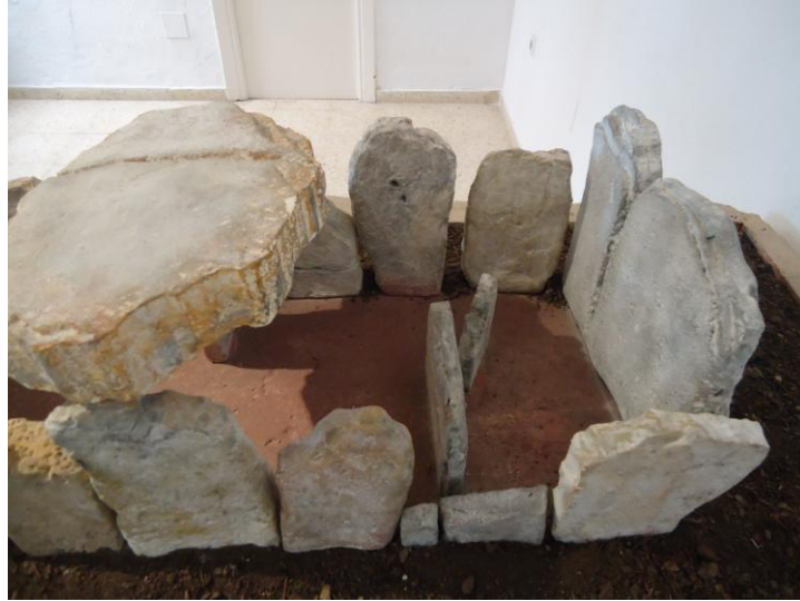
Fig 5c. Exact placement of Alberite Dolmen ritual “Ear-like” holes. (Photograph taken out from above).