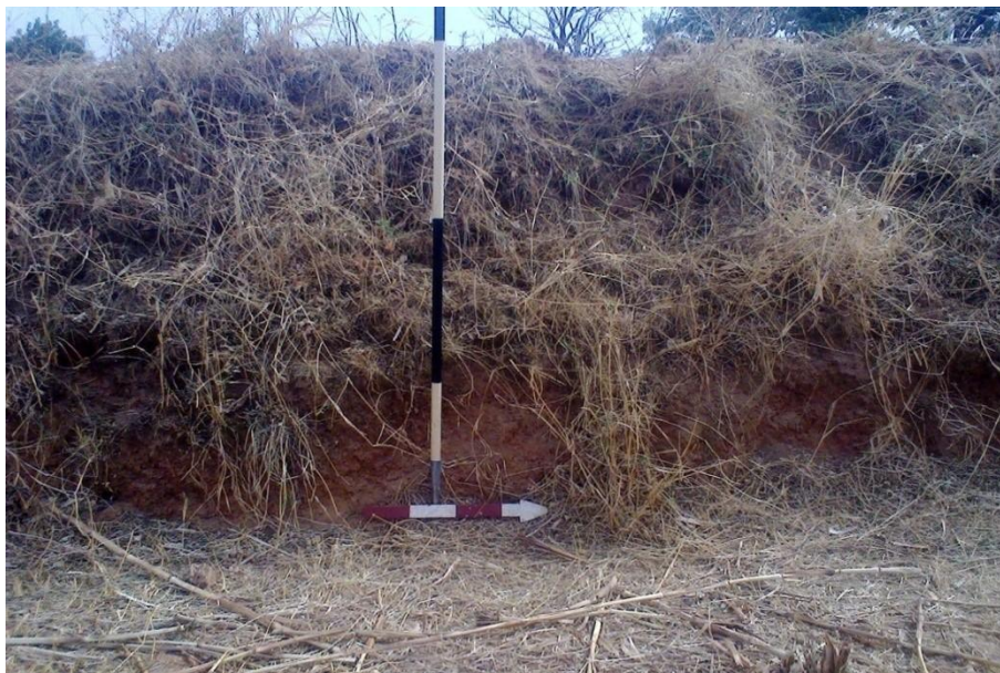
Fig. 5: Defensive Wall

A total of 99 potsherds were among the finds collected from the surface using quadrant to collect samples in their primary context for further analysis and processing ( Fig. 6 ). It justifies the claim that pottery is one of the oldest human activities amongst the people of Karofi. The potsherds help immensely in understanding the pre-historic societies in the Hausa land, especially in relations to the use and functions of pottery. Apart from their aesthetic values, they also serve a number of purposes ranging from storage to religious rites.