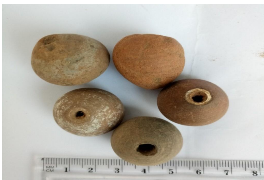
Fig. 3: Spindle Whorls

Similarly, the spindle whorls identified were spherical in shapes and each has a round hole at the center. It was said to be used for weaving in the past. They are made of clay material. It is identified as reddish brown and brown in colour ( Fig. 3 ). Their presence in the site further suggests the peoples' involvement in weaving and cloth production.