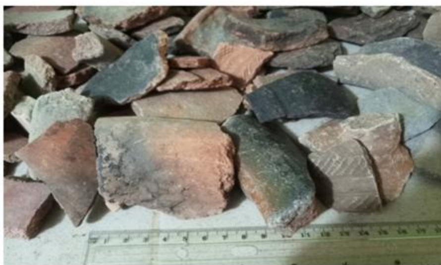
Fig. 6: Potsherds

A total of 99 potsherds were among the finds collected from the surface using quadrant to collect samples in their primary context for further analysis and processing ( Fig. 6 ). It justifies the claim that pottery is one of the oldest human activities amongst the people of Karofi. The potsherds help immensely in understanding the pre-historic societies in the Hausa land, especially in relations to the use and functions of pottery. Apart from their aesthetic values, they also serve a number of purposes ranging from storage to religious rites.