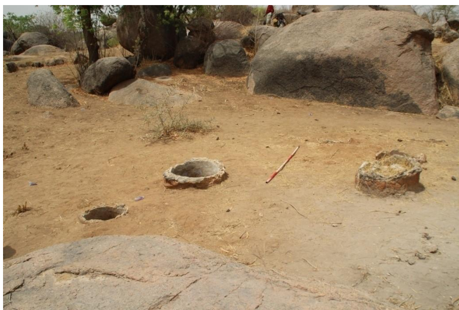
Fig. 4: Dyeing Area

Dye centre one (1) is located in the western part of the site. It constitutes a cluster in each area, of about 3-5 dye-pits. The soil is loose and grey. Associated finds were two fragmentary smoking pipes. The dimension of the dye-pits was taken as follows; diameter 75cm to 80cm, with a depth of 1.5m. Oral tradition has it that the dyeing area was said to have belonged to Ali maikaurindahi (Ali with high concentrated poison). It is said that the pits apart from dyeing activities, were also used to prepare poison, smeared on arrows used for hunting and military purposes ( Fig. 4 ).