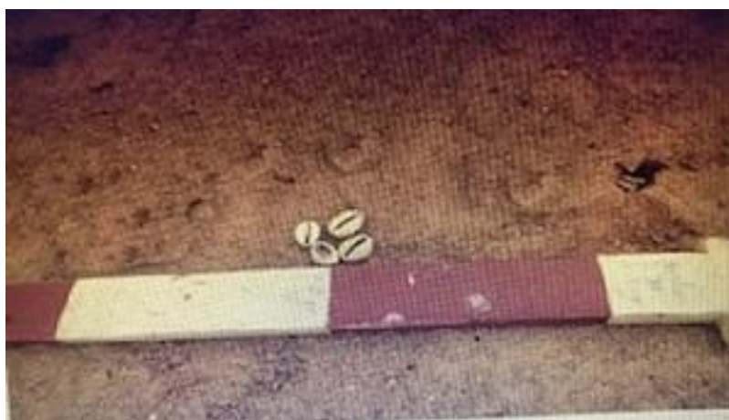
Fig. 2: Cowry Shells

were given to the Department of Archaeology and Heritage Studies of Ahmadu Bello University, Zaria as samples taken for dating (See Fig. 2 )