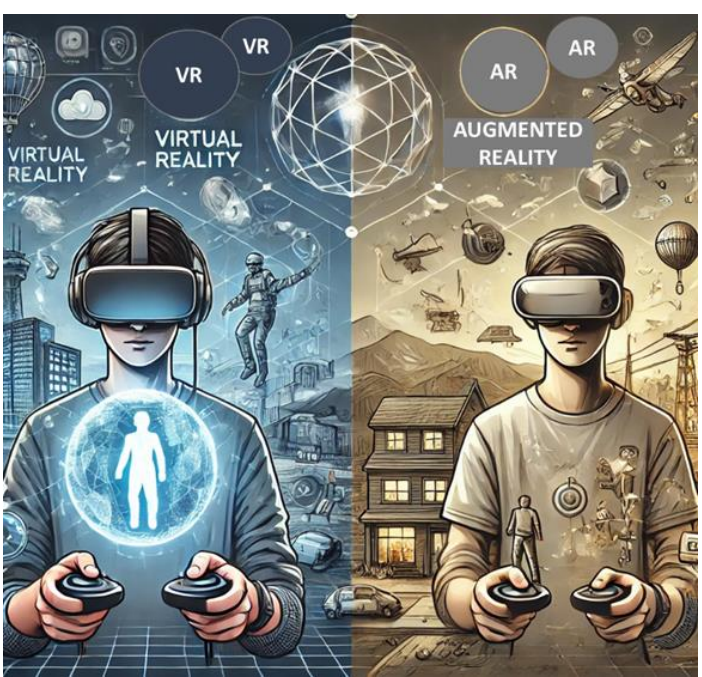
Figure 1: Image of Virtual Reality vs Augmented Reality

In technical and vocational education and training institutions, incorporating technology-enhanced personalized learning has shown great promise in bridging the gap between theory and practice. The Page | 154 use of virtual reality (VR) and augmented reality (AR) is on the rise (See Figure 1), enabling the simulation of real-world scenarios and providing students with hands-on learning experiences in a safe and controlled environment (Vats & Joshi, 2024). Furthermore, artificial intelligence (AI) and machine learning can analyze student performance data to recommend customized educational paths, ensuring that each learner gets the support they need to succeed academically. These technological innovations not only enhance the learning experience but also prepare students for the increasingly digital workplaces of the future.