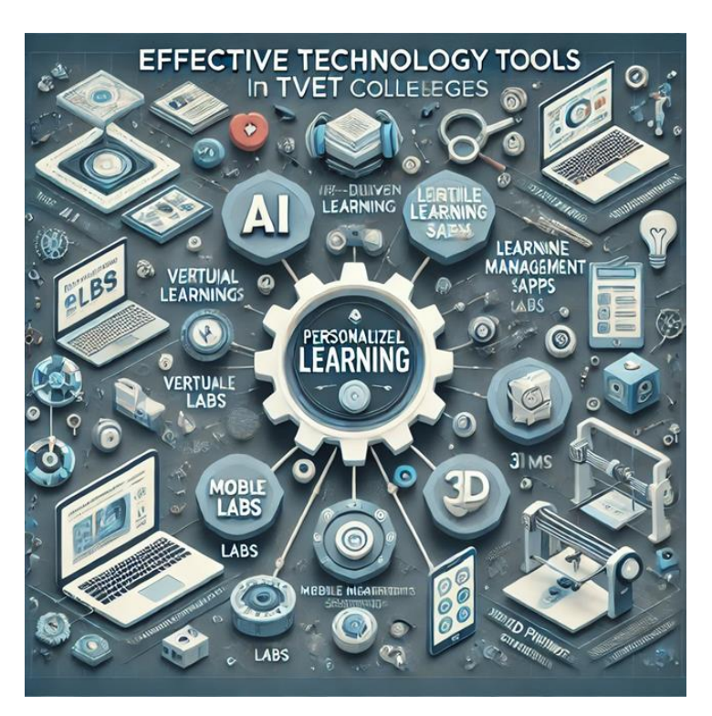
Figure 3: Effective Personalized Learning Tools