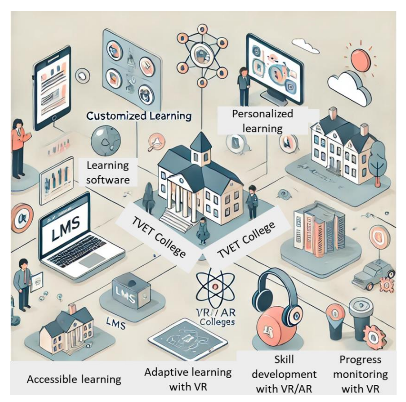
Figure 4: Image of Tools and Infrastructure for PL in TVET Colleges

Virtual and augmented reality (VR/AR) is changing the way personalized learning is approached in TVET colleges by delivering immersive, hands-on training in simulated environments. VR offers a safe platform for students to practice complex skills, while AR adds interactive digital features to real-life scenarios (Chiu & Tsuei, 2022). These technologies enhance skill acquisition, boost engagement, and deepen understanding, providing students with tailored, industry-relevant experiences that effectively link theory with practice. The use of data analytics greatly improves the tracking of progress in personalized learning settings at TVET colleges. By gathering and analyzing student performance data, it identifies areas where students may be struggling, assesses their engagement levels, and provides valuable insights for tailored interventions. As a result, educators can modify their teaching strategies based on real-time analytics, helping each student to effectively achieve their educational objectives.