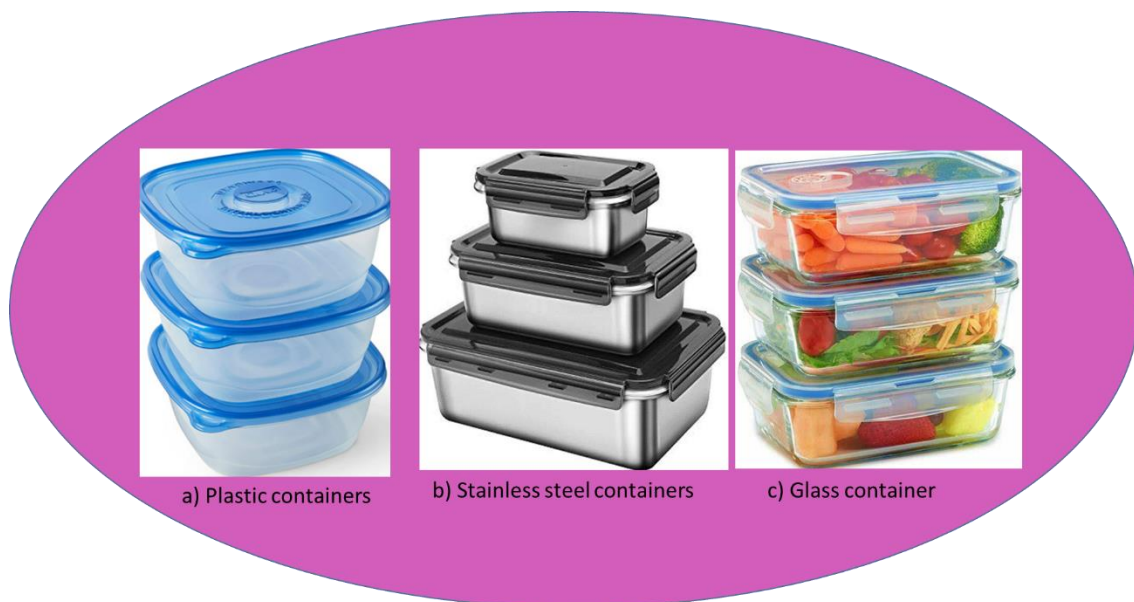
Figure 5: Three Different Food Storage Containers

steel can be used. The three food containers are shown in Figure 5. The following are some precautions to be taken when using plastic containers: i) Fatty foods including meat and fish should not be stored in plastic containers that contain bisphenol A (BPA) or phthalates as the chemical can react with them (Fasano & Cirillo, 2018). ii) Acidic food such as those containing tomatoes and citrus can react with plastic container made of polyvinyl chloride (PVC), and result to food poisoning (Lahimer, Ayed, Horriche, & Belgaied, 2017). So, PVC plastic containers should not be used to store acidic foods. iii) Non-heat-resistant plastics should not be used to store hot foods because it can distort the container and stimulate the release of harmful substances to the food. When using stainless steel containers, the following precautions should be adhered to: i) Table salt (sodium chloride) is corrosive to stainless steel. So, highly salty food should not be stored in stainless steel container as this will induce corrosion and subsequent contamination of the food (Subari, Maksom, & Zawawi, 2015). ii) Acidic foods are reactive to stainless steel containers. So, foods containing tomatoes, vinegars, citrus, etc should not be left for a long time inside a stainless steel container (Petrovič & Mandrino, 2016). iii)