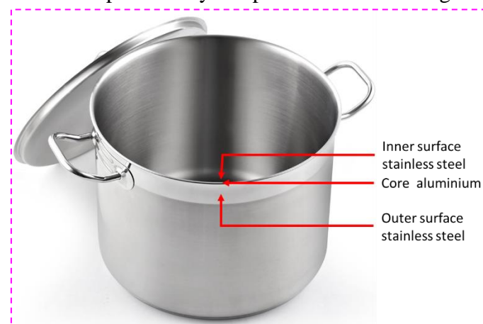
Figure 4: Hybrid Pot

Based on the above findings, it is suggested that the following precautions must be abided by to avert possible challenges accruable from corrosion of kitchen/household utensils. A hybrid pot is recommended as the best pot for cooking. In this innovation, the core is made of aluminium which possesses higher thermal conductivity than stainless steel (Carvalho, Galvão, Mendes, Leal, & Loureiro, 2018), such that heat input will be transferred to the food with less resistance. The outer and inner surfaces are made of stainless steel which has better shining, less-reactive and better abrasive property than aluminium. The hybrid pot gives the optimal performance that cannot be obtained from either aluminium or stainless steel pot. The hybrid pot is as shown in Figure 4.