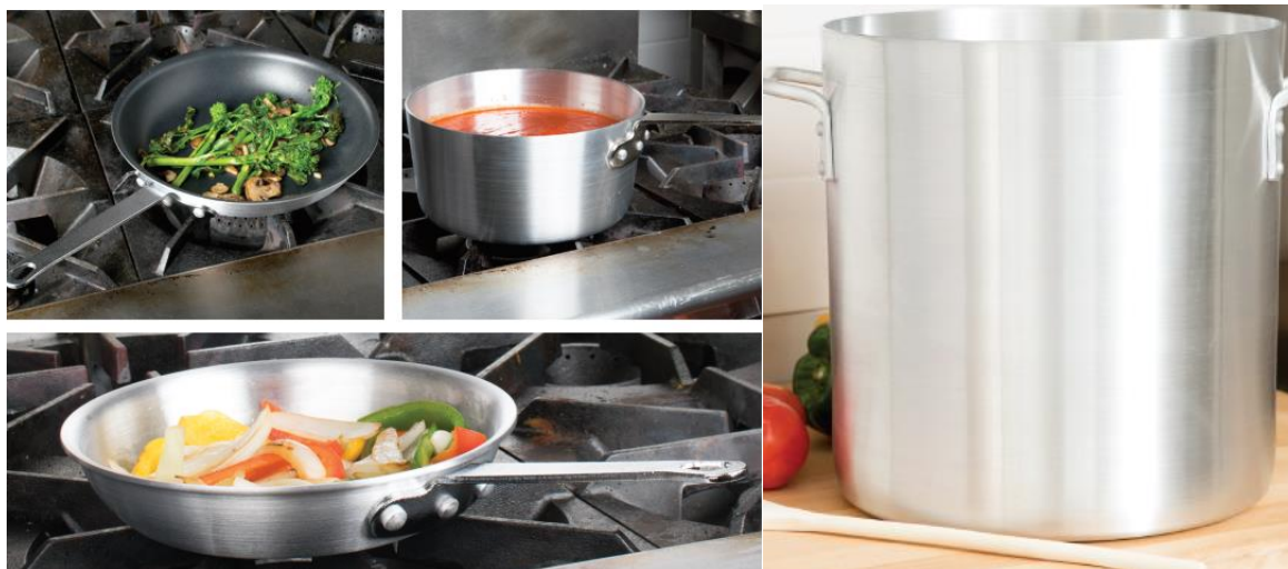
Figure 1: Aluminium cookware (Gupta et al., 2019)

Aluminium is the most suitable material for kitchen utensils. Aluminium and its alloys are commonly utilized in various ways, including but not limited to, building, electricity (Ujah et al., 2022) and vehicles, aerospace, and in the production of cookware and food packaging. Aluminium's high utility stems mostly from its extraordinary characteristics. In poor countries, craftsmen exploit the