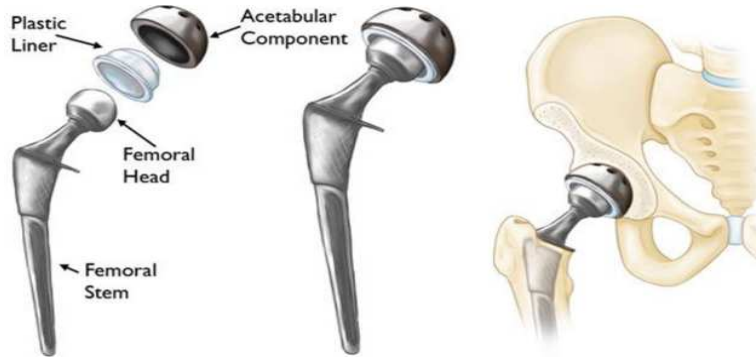
Figure 1. Different component of prosthetic hip joint(Ghalme et al., 2016)

Hip joint contains femoral stem, femoral head, plastic liner and acetabular cup (Ghalme, Mankar, & Bhalerao, 2016). An artificial is kind of prostheses (synthetic body part) that contain two or more component. It usually a stem which fit into the femur and at the top of stem a ball like structure fitting is known as femoral head. This femoral head fit into acetabular component. Plastic liner uses between femoral head and acetabular cup which provides a smooth gliding surface of the ball with minimum wear. In general, hip implant is similar to loading as real bone and it is also act as biocompatible.