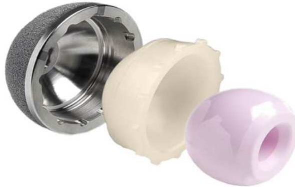
Figure 3. Bearing surface use in hip implant (internet source, n.d.)

Bearing is made of different type of material and selection of bearing surface is very important for hip joint replacement. For hip joint replacement metal, ceramic, polymer or combination of these material use depend upon age, living standard and body weight. Selecting the bearing surface also depends upon durability, level of performance, performance level and your personal needs ( https://www.elvisgrandicmd.com/hip-replacement/technology/bearing-surfaces , n.d.).