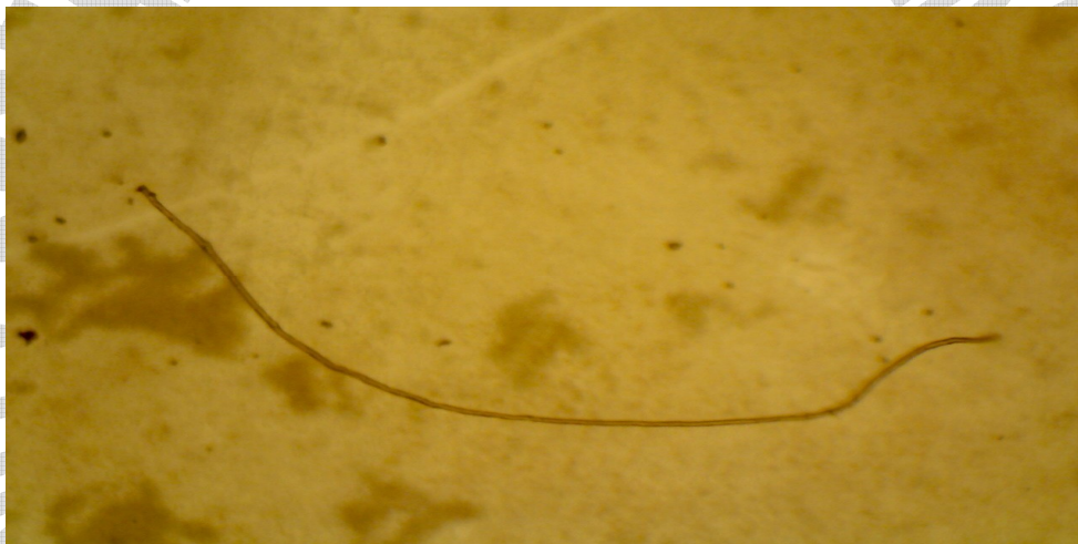
Plate 2: Wet mount micrograph showing anterior and posterior end of W. bancrofti in serum of patient (X 40 objective)

Concerning the drug treatment of lymphatic filariasis, diethylcarbamazine (DEC) is effective against both microfilaria and adult worms. DEC lowers the blood microfilaria levels significantly even in single annual doses of 6 mg/kg which is sustained (Emilio, 2008) and as effective as the same dose that was earlier recommended daily for 12 days by WHO (Ottesen et al., 1997). The transmission of this disease is prevented by the sustained destruction of microfilaria from a single annual dose of DEC (Emilio, 2008). The adverse effects produced by the drug are due to their rapid destruction of microfilaria which is characterized by fever, headache, myalgia, sore throat and cough lasting for up to 24-48 hours (Andrade et