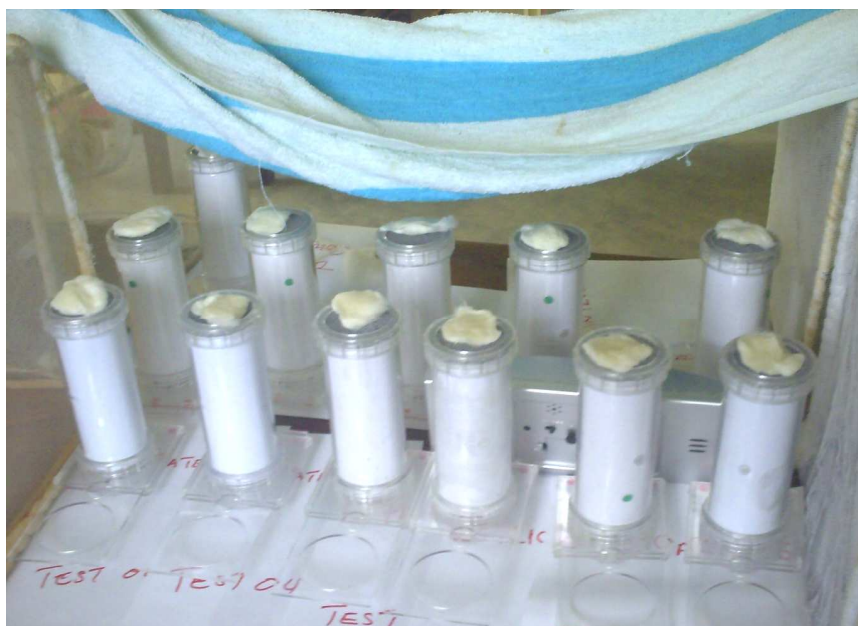
Figure 3: Our 24-hour holding process on 21 st - 22 nd October 2009.