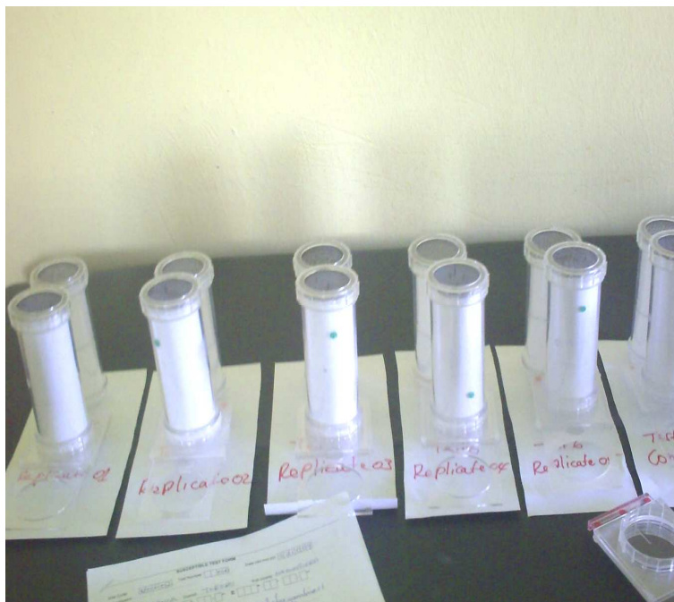
Figure 2: The susceptibility/vector resistance study tubes of our work on 21 st Oct 2009.