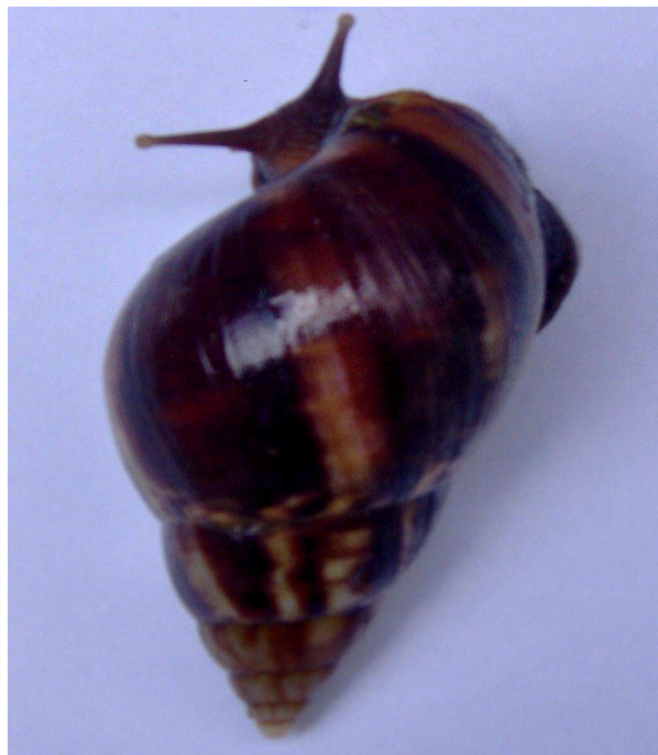
Figure 2: Photo of Achatina achatina .