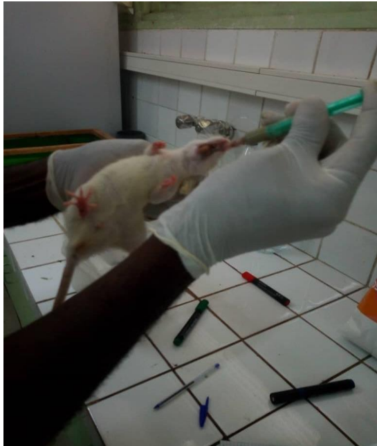
Figure 2: Gavage of rats with a curved steel needle.