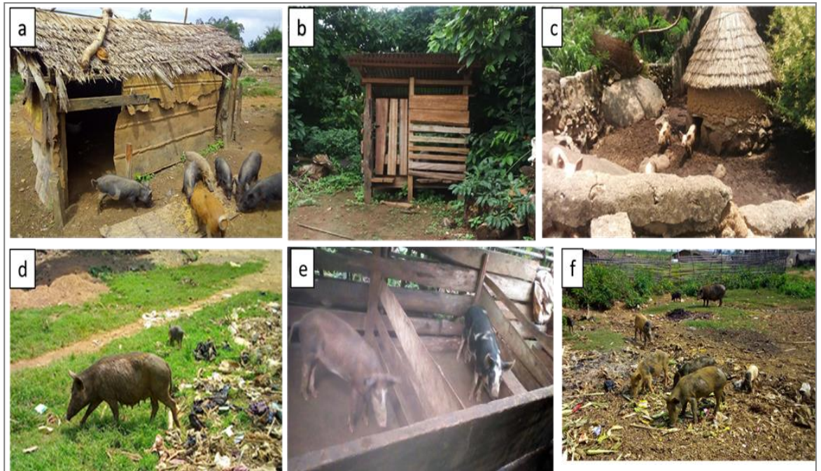
Figure 2: Types of piggyeries in the three agro-ecological zones: a) old iron sheet pens in HBA and c) constructs with mud bricks in SSA were semi-extensive; b,e) wooden pens in WHA; d,f) extensive pig farming system in HBA and SSA.