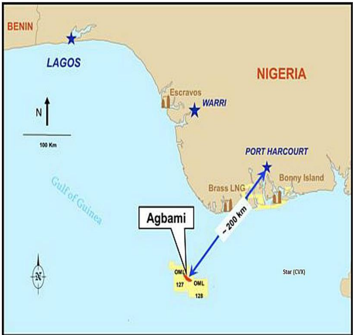
Figure 3: Map of study site.

Information from JNCC record of Sighting forms were analyzed using descriptive statistics, correlation and Analysis of variance (ANOVA) at p=0.05 .