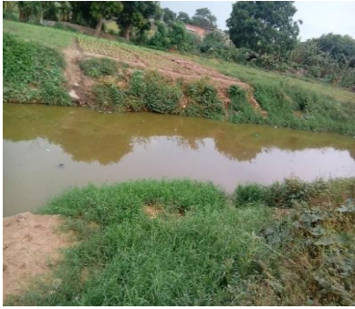
Figure 2: Spring water.