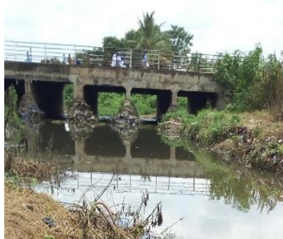
Figure 3: Water collector.