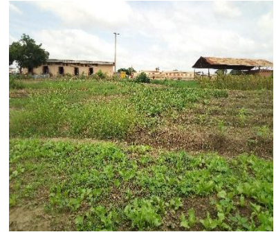
Figure 4: Market garden.