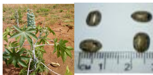
B : Martap accession