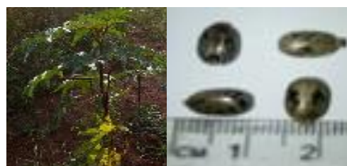
D : Bélel accession