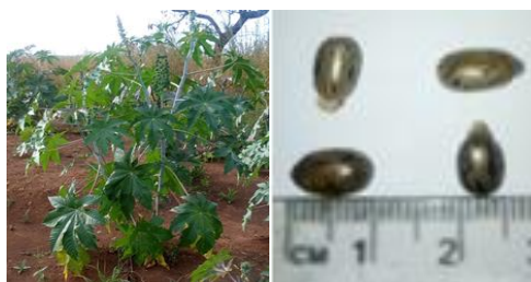
A : Vina accession

Data were subjected to variance analysis followed by the Duncan multiple range tests when any significant effect was observed. The statistical software “Statgraphics plus” was used for this propose. Excel 2010 software was used for data entry and graphing.