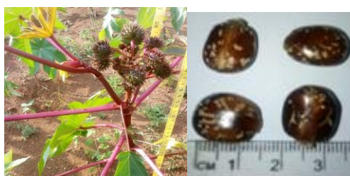
C : Nyambaka accession