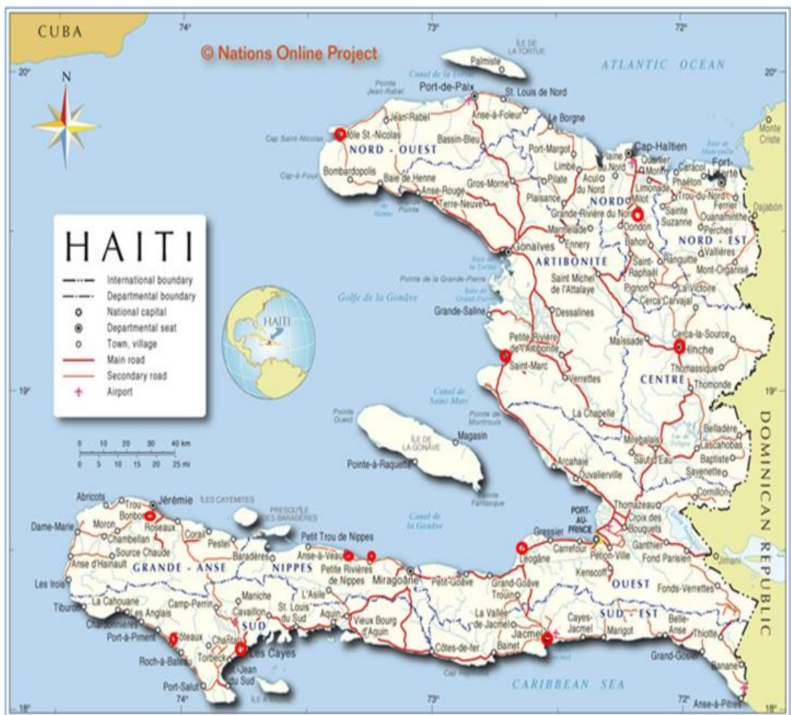
Figure 1: Administrative map of Haiti with red points indicating the origin of the sampled taro accessions.

tests, prior analysis of variance (ANOVA). A two-way ANOVA was carried out using sites, genotypes and sites x genotypes as fixed and the Ryan-Einot-Gabriel-Welsch-F test (REGW-F) was used to detect significant differences among means (Assa et al., 2012). Pearson’s rank correlation coefficients ( \rho ) were computed for all recorded traits and the obtained results were used to build a correlation matrix. Similarity among taro cultivars was checked with Clustering Analysis (CA) using Hierarchical Cluster Method based on Euclidean distance (Crossa and Franco, 2004; Oladipo and Illoh, 2010).