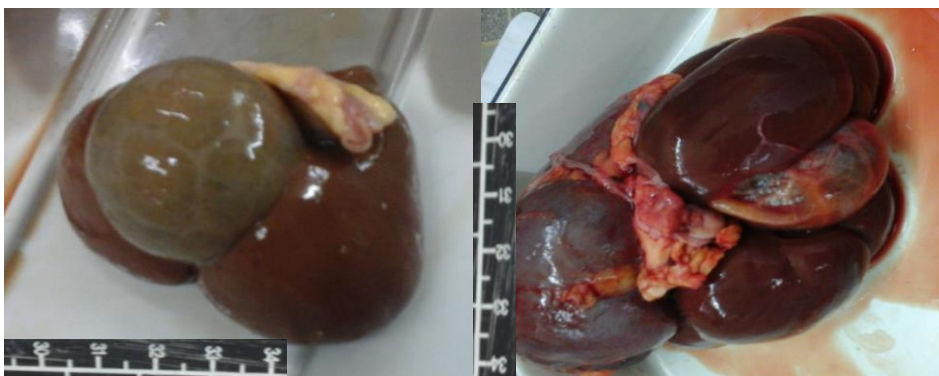
Figure 2: Bovine liver showing Echinococcus cyst.